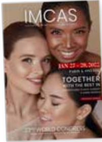
IMCAS WORLD CONGRESS JANUARY 27 TO 29, 2022 PARIS & ONLINE